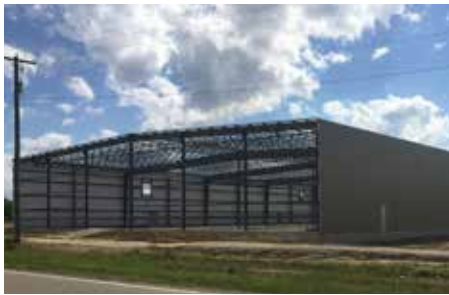
Nier River Road

Sites ideal for joining the automotive and truck supply chain.