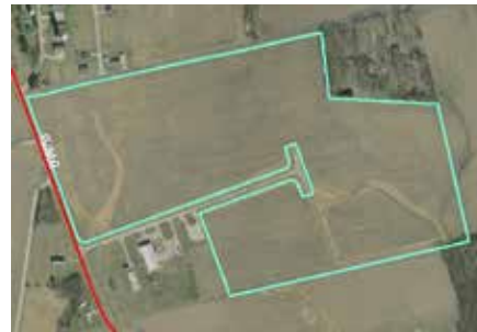
Leesburg Industrial Park SiteOhio Authenticated 80.35 flat shovel-ready acres

Thriving in APEG are 1,113 manufacturing companies including these in metals manufacturing and fabrication.