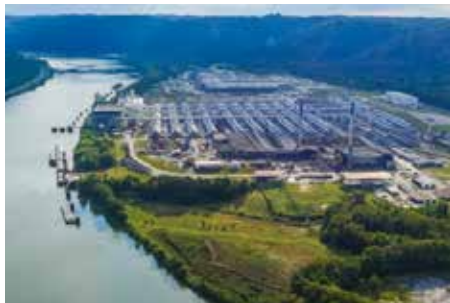
Center Port Terminal Exceptional utility capacity, two harbors accommodate 48 barges

These sites would be ideal for locating a Metals Industry.